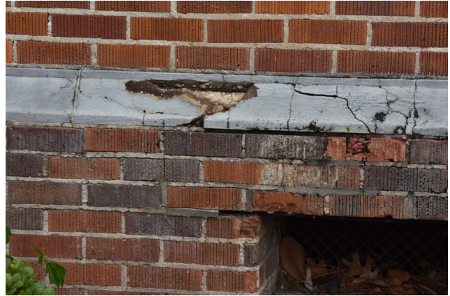
SHC Masonry #2