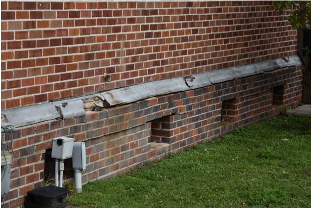
SHC Masonry #1