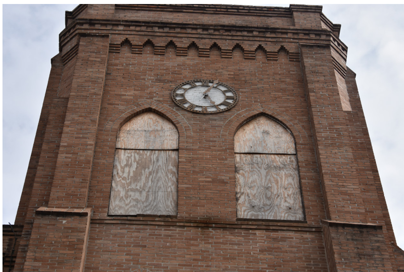
Missing bell tower louvers