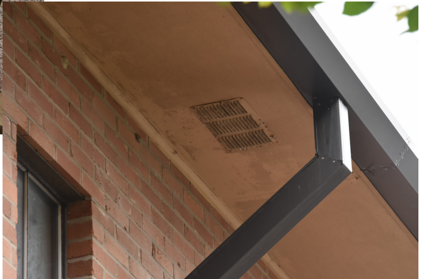
Rectory Soffit #1