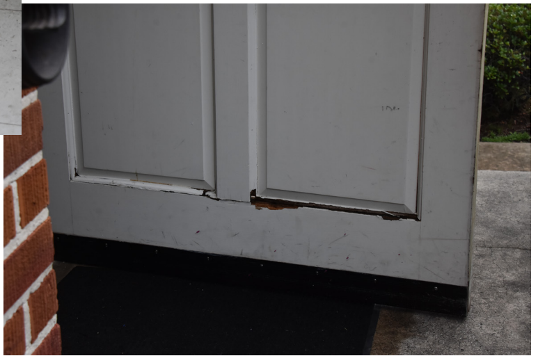
SHC door #2