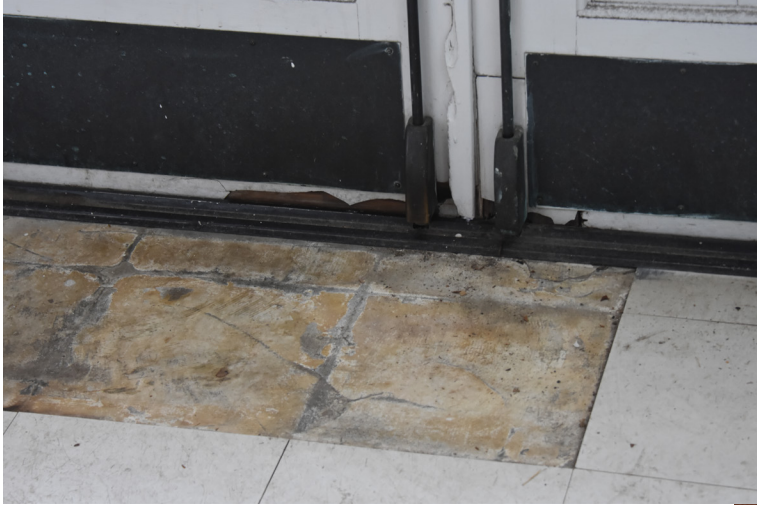
SHC door #1