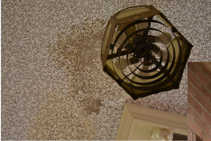
Cathedral ceiling leak below bell tower