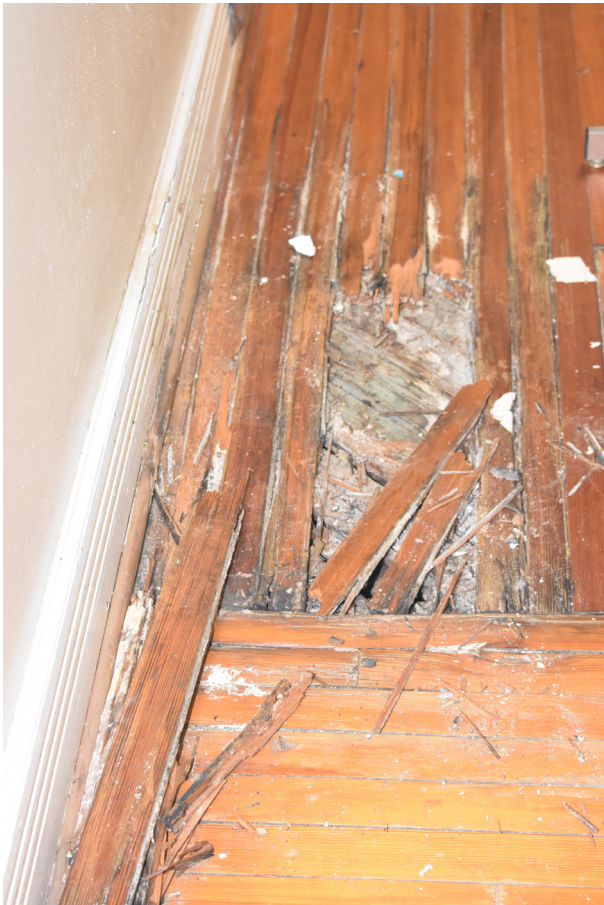
SHC floor damage