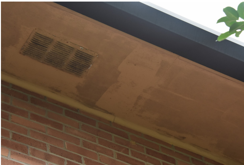
Rectory Soffit #2