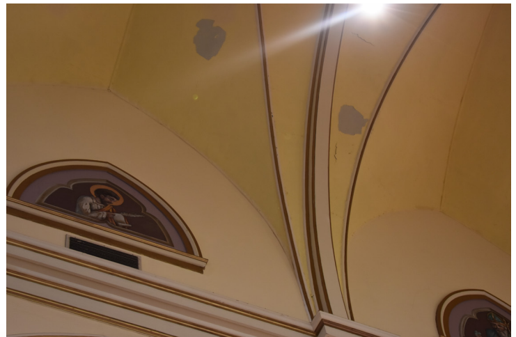
Cathedral Ceiling damage #2