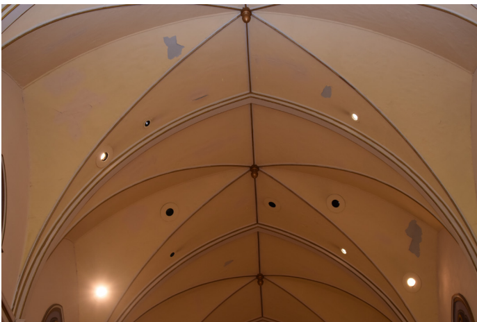
Cathedral Ceiling damage #1